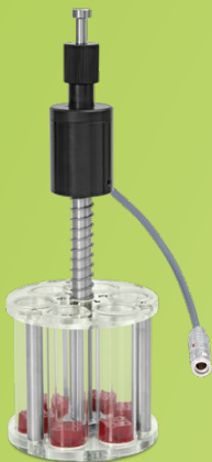
AutoBasket type A (with 6 test tubes, for ZT 720 series only)