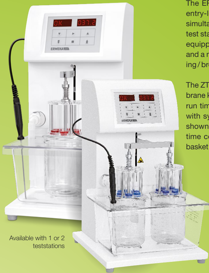
Available with 1 or 2 teststations

The ERWEKA ZT 120 light series are the perfect entry-level disintegration tester with one or two simultaneously motor driven USP/EP/JP compliant test station. The compact unit of our light series are equipped with an integrated flow-through heater and a moulded one-piece PET water bath (no leaking/breaking, easy to clean) with cover.