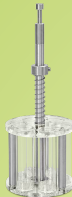
Quick Clean Basket type A (with 6 test tubes or type B with 3 test tubes)