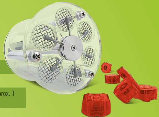
AutoBasket for automated testing uses a magnetic guided disc and sensors under the USP/EP compliant sieves