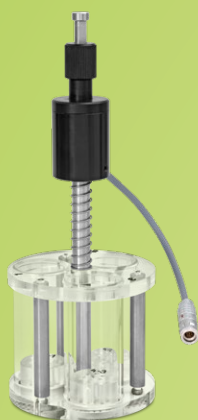
AutoBasket type B (with 3 test tubes, for ZT 720 series only)