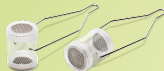
Auxiliary tubes for granule testing, JP pharmacopoeia confirm