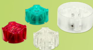
Different coloured discs for type A and B baskets, non-magnetic and magnetic for AutoBaskets