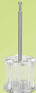
Basket type A (with 6 test tubes or type B with 3 test tubes)