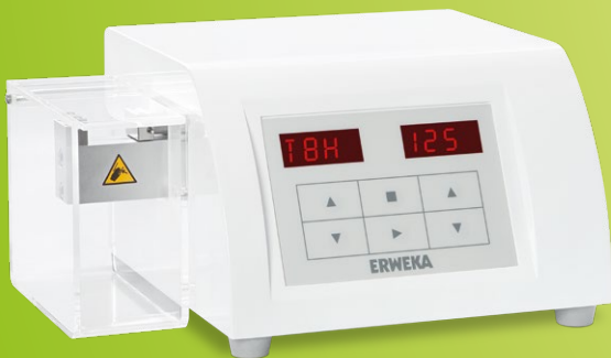
TBH 125 with collection container

ERWEKA GmbH Pittlerstr. 45 63225 Langen Germany